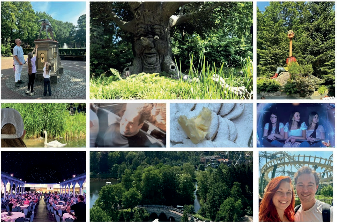
A wonderful day at the Efteling

It has been a while since we visited the Efteling, but we look back on another successful family day! Freedom is always the theme of this day, so everyone went their own way. The real thrillseekers sought out the roller coasters and the Fairytale Forest was visited en masse by those with children. On to the next edition!