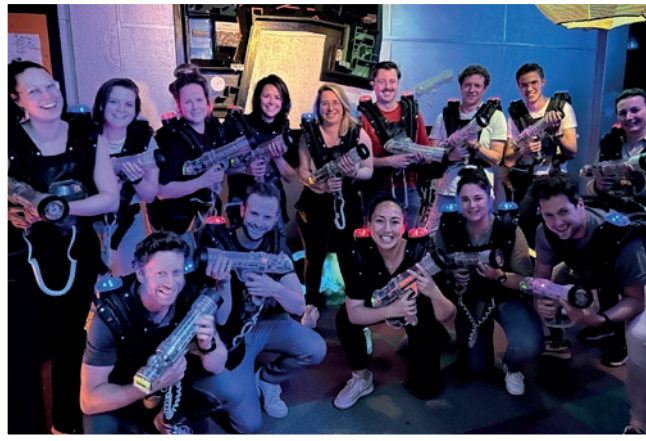
Teamwork makes the dream work!